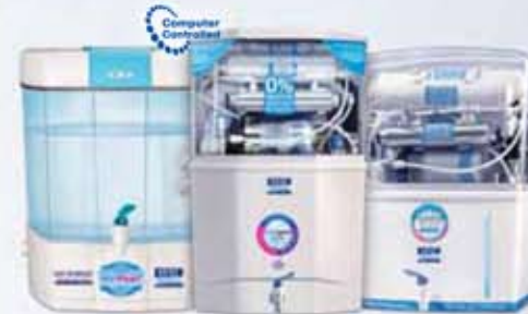
Remove even dissolved impurities and maintain essential minerals with the widest range of RO water purifiers